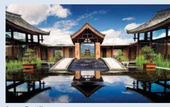
Banyan Tree Lijiang